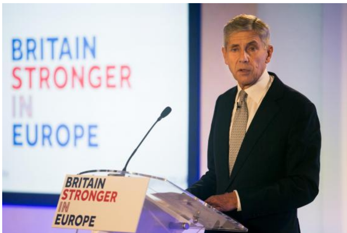
Lord Rose launches the Britain Stronger In Europe campaign

Schengen abolishes border controls between countries during normal times, though they can be re-instated under the agreement under special circumstances.