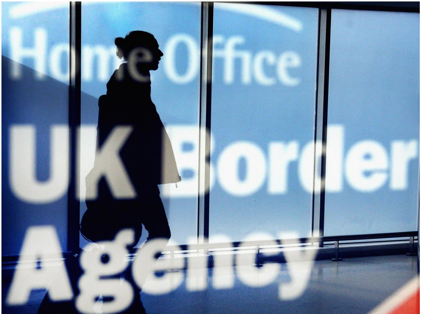
The UK retains border controls with other EU countries but citizens have freedom of movement between member states